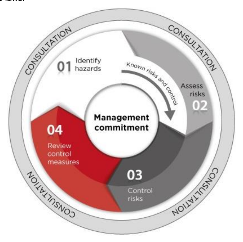
Figure 1 The risk management process

Further information is available in the Interpretive Guideline: The meaning of 'reasonably practicable'. The process of managing risk described in this Code will help you decide what is reasonably practicable in particular situations so that you can meet your duty of care under the WHS laws.